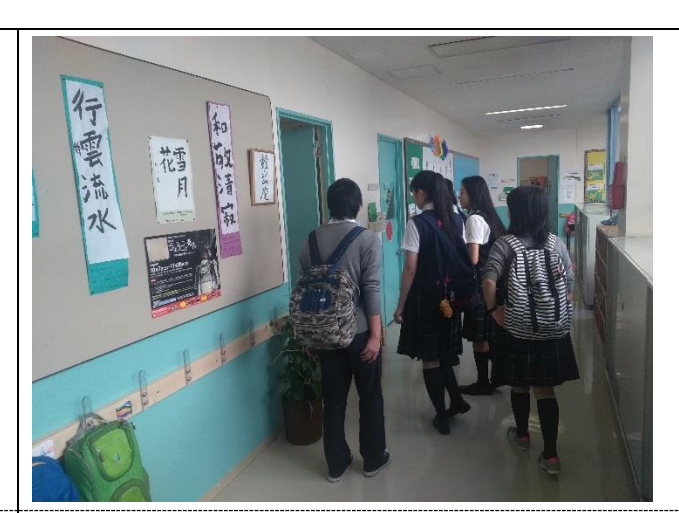
School tour, Japanese class