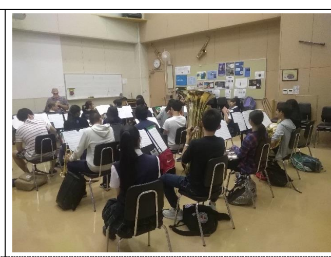
1st period class, "Music lesson"