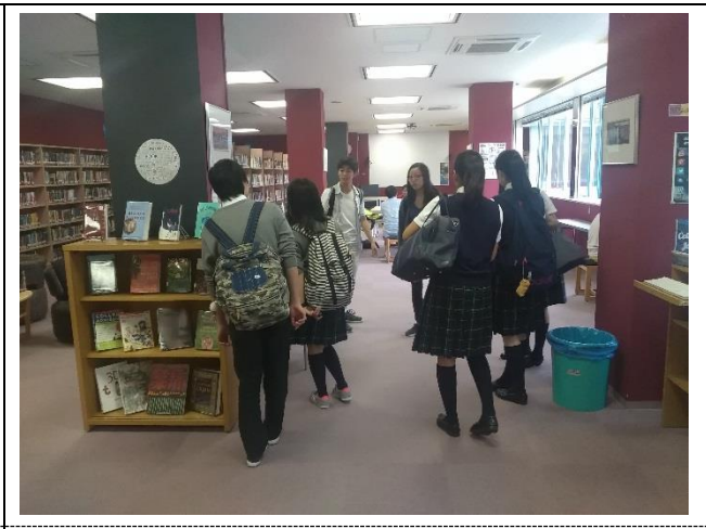
School tour, Library