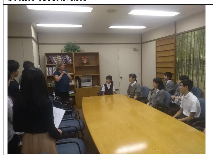
Receiving welcome speech from the principal