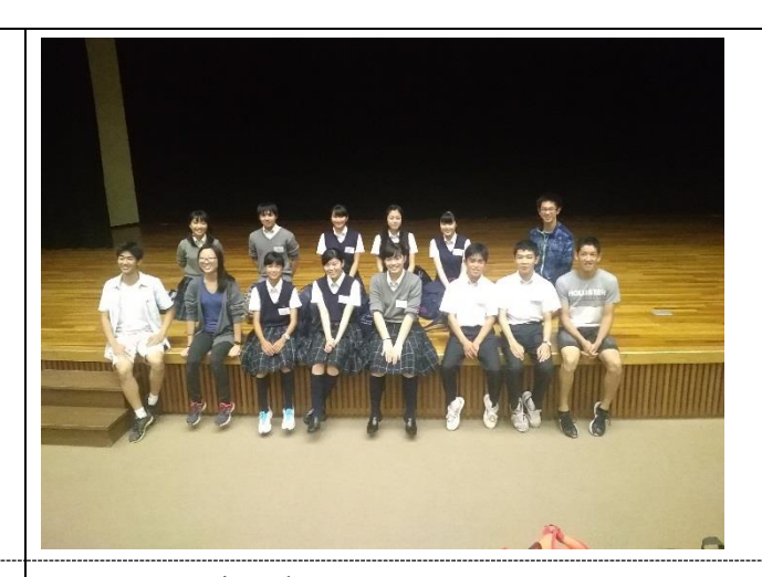
School tour, Theater Words of gratitude