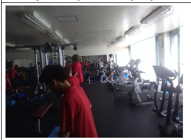
2<sup>nd</sup> period class, "P.E. lesson"