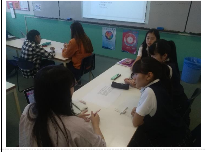
2<sup>nd</sup> period class, "English lesson"