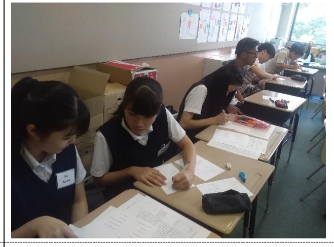
3<sup>rd</sup> period class, "Japanese lesson"